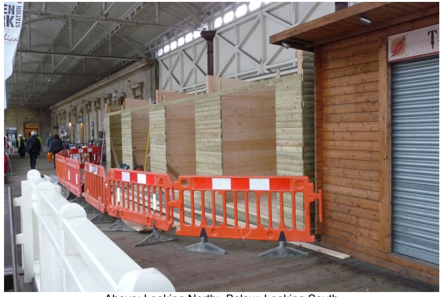
Above: Looking North; Below: Looking South